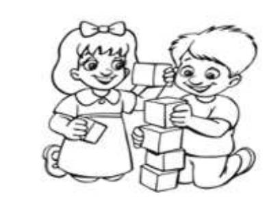
Children are the future of the human race